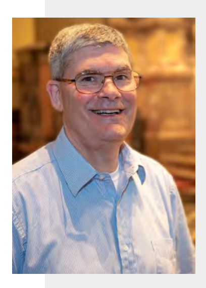
"St. Ignatius would say to start by examining our feelings throughout the day."

At every stage of life, we engage our members to learn. From our Blue-Ribbon school to our K-8 Religious Education program, preparation for Marriage and Baptism to opportunities for young adults and parents, we are dedicated to fostering deeper knowledge of God and self as we grow step by step.