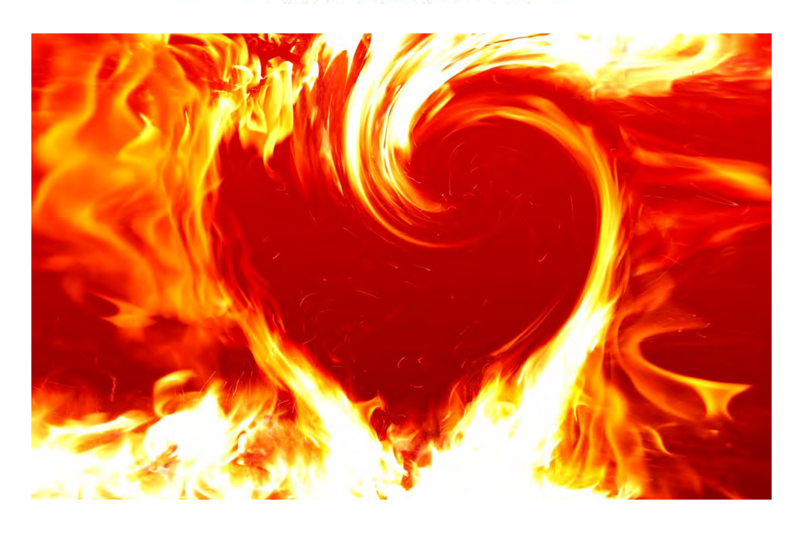
"There an angel of the LORD appeared to Moses in fire Flaming out of a bush." Exodus 3:2